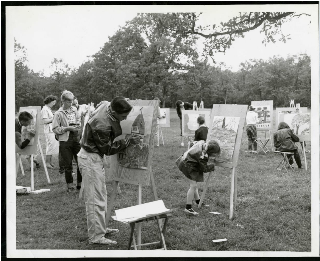
Painting in the Park, 1959

Does your archive have a new grant or a new hire? Or do you have a collection you want to promote? Send your news to ama1@mts.net and we will include it in an upcoming newsletter.